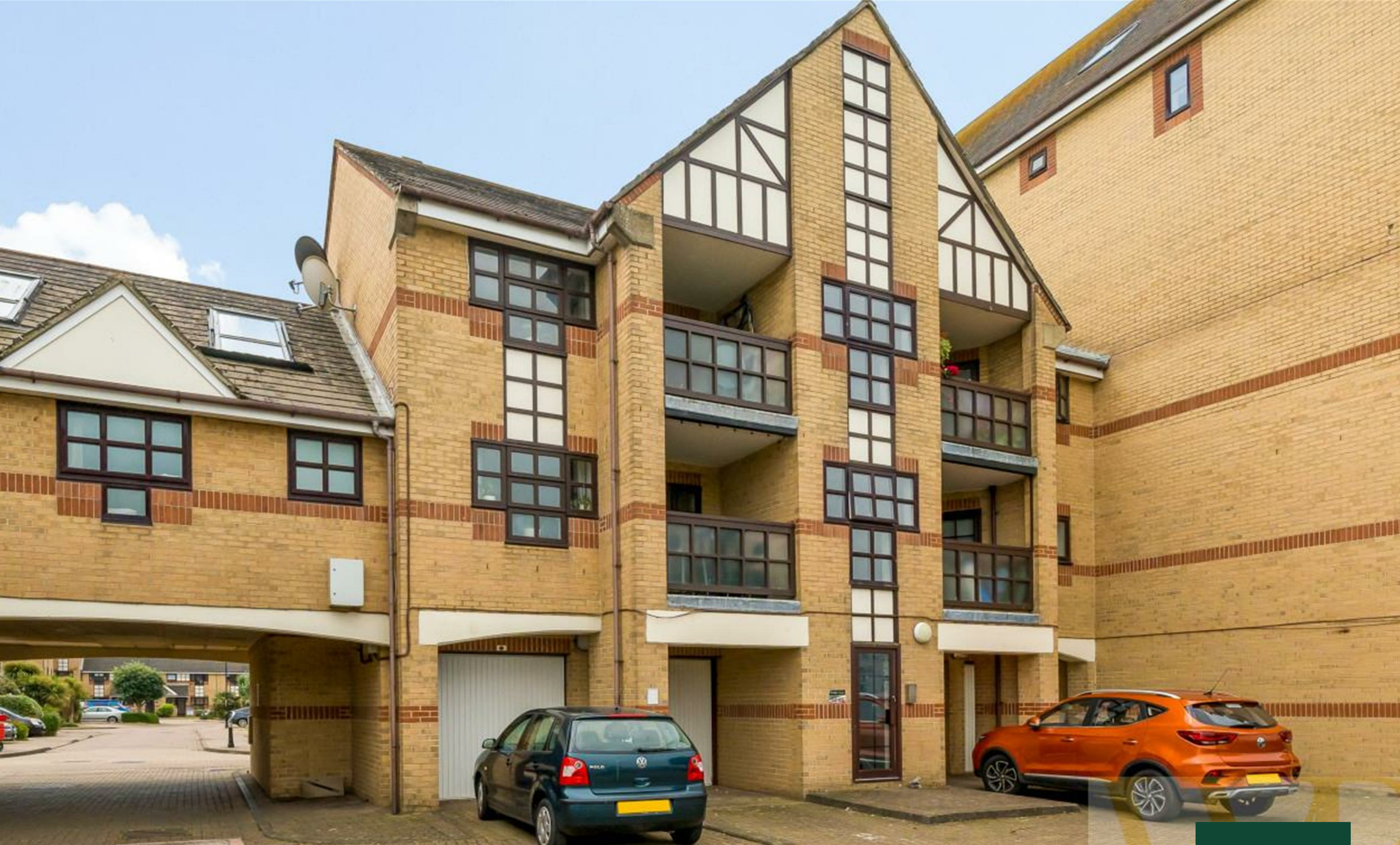
12 Marys Place Emerald Quay | | Shoreham | BN43 5JS